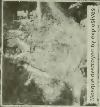
Mosque destroyed by explosives