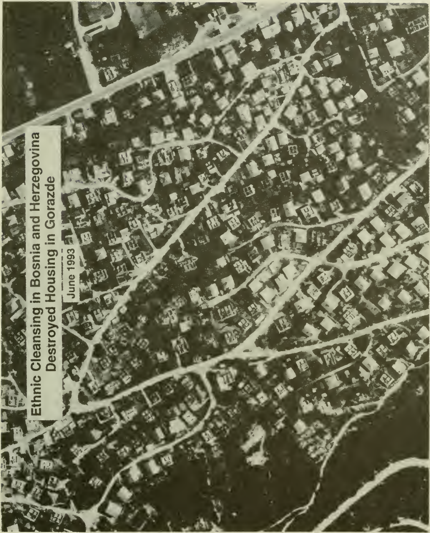
Ethnic Cleansing in Bosnia and Herzegovina Destroyed Housing in Gorazde