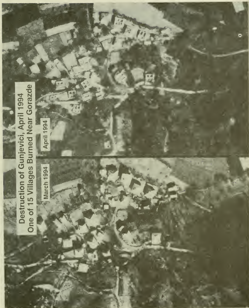
Destruction of Gunjevici, April 1994 One of 15 Villages Burned Near Gorazde